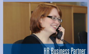
HR Business Partner