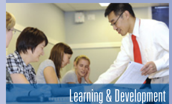
Learning & Development