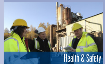
Health & Safety